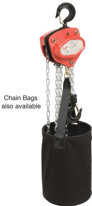
Chain Bags also available